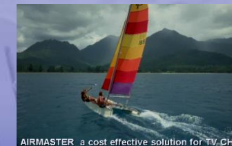
EAS, PSA & News “tickers”