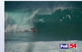
ID with Time & Temp